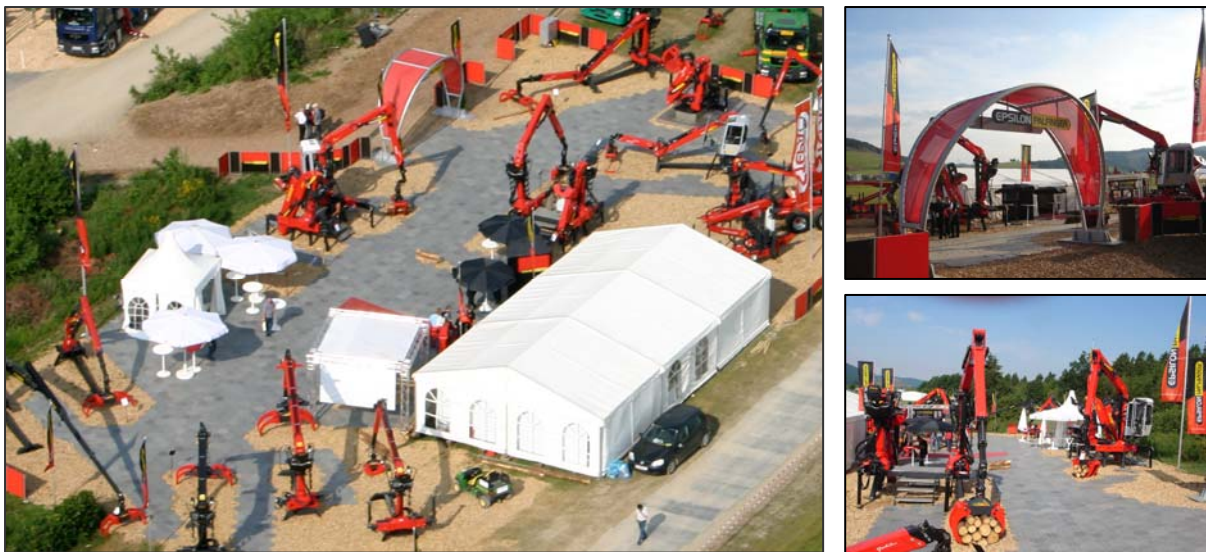
Aerial photograph EPSILON stand KWF-Tagung 2008

EPSILON has introduced the new product range for the first time on the this year's KWF-Tagung in Schmallenberg (Germany). The new crane generation EPSOLUTION was of high interest for the customers. The KWF-Tagung 2008 was without doubt a very big success. The complete product range was presented on an area of 800 m 2 to 43.000 visitors. The new models are available from August 2008.